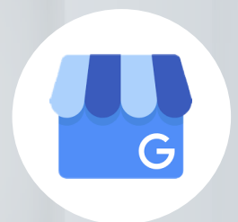
Google My Business